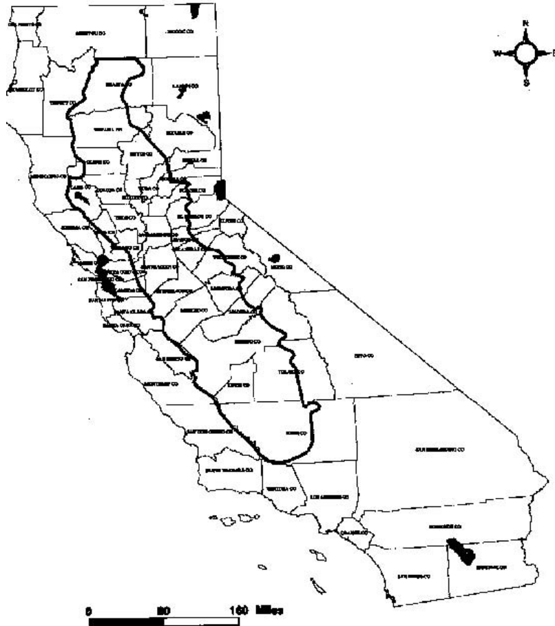
Figure 1: Ranges of the Valley Elderberry Longhorn Beetle